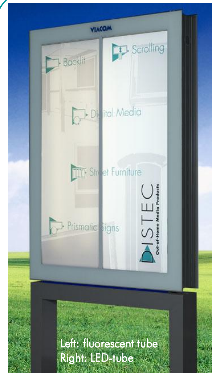
Left: fluorescent tube Right: LED-tube